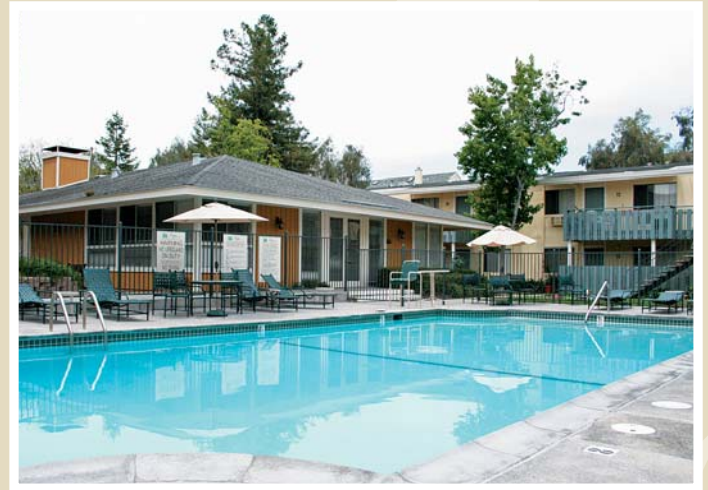
Work, play and live better at Sage Cupertino.

Sage's spacious and serene apartment homes are perfect for every lifestyle. Surrounded by lush landscaping, our living spaces are bright and feature full kitchens and washer and dryers in select homes. This charming community is conveniently located near major freeways and is just minutes away from neighborhood parks, shopping and dining. You will find all the conveniences designed for easy living at Sage Cupertino.